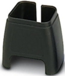
Color marking for patch cable, black

Please be informed that the data shown in this PDF Document is generated from our Online Catalog. Please find the complete data in the user's documentation. Our General Terms of Use for Downloads are valid ( http://phoenixcontact.com/download )